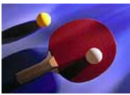
TABLE TENNIS & VACATION!